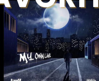
"MY TEAM KILLING IT" MY OWN LANE