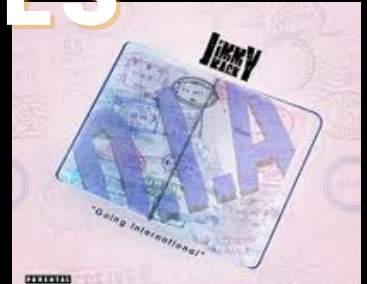
"O.I.A." [SINGLE - 2019]