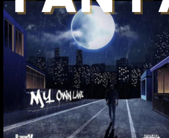
"SUNSHINE" MY OWN LANE