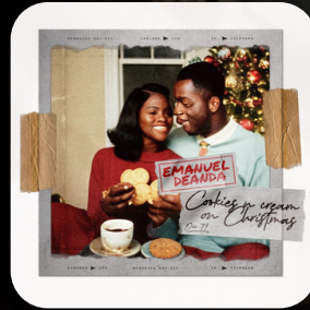
"COOKIES N CREAM ON CHRISTMAS" [2022]