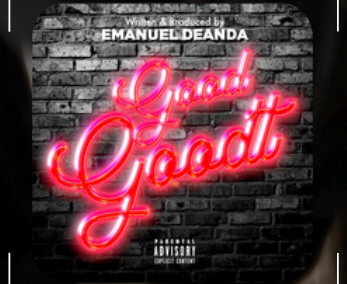
"GOOD GOODT" [2021]