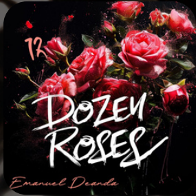
"12 DOZEN ROSES" [2024]