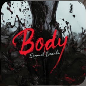
"BODY (NA NA NA)" [2024]